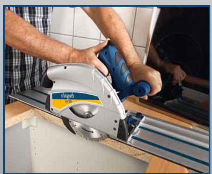
Perfect for kitchen worktops. Only possible with a plunge saw system. Even an amateur can achieve exact parallel splinter free cuts using the cs 55 with optional guide track system.

• With the cs 55, anyone can get great results in the shop or on the jobsite