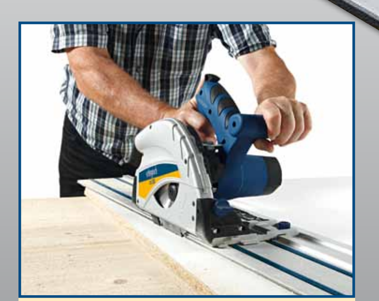
Achieve cuts usually performed on a panel sizing table saw: perfect parallel and trim cuts.