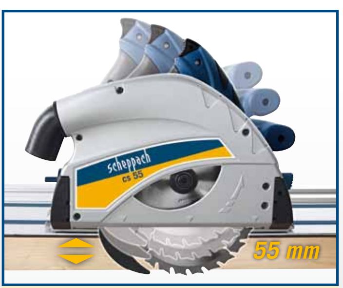
55 mm maximum stepless cutting depth.