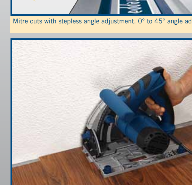
Ideal for edging up to 15.5 mm from the wall. Another example of cs 55 diverse operations.