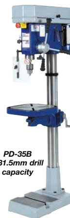
PD-35B Ø31.5mm drill capacity