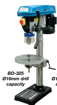
BD-325 Ø16mm drill capacity