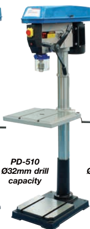
PD-510 Ø32mm drill capacity