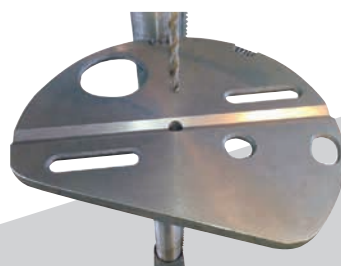
VAZEY DRILL PRESS TABLE • Cast iron table • V groove locates round pipe • No clamps or jigs needed • Suits 47mm bore