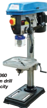
BD-360 Ø16mm drill capacity