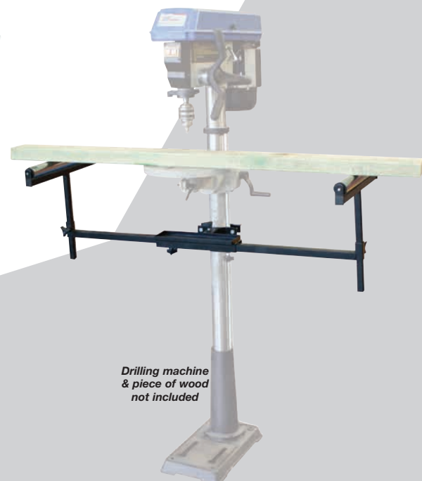
Drilling machine & piece of wood not included