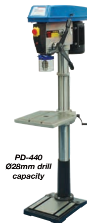
PD-440 Ø28mm drill capacity