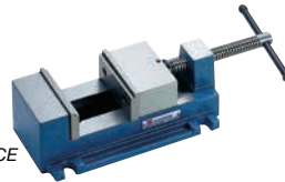
PRECISION DRILL PRESS VICE with step jaws