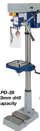
PD-28 Ø23mm drill capacity