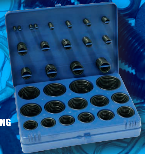
METRIC - O-RING ASSORTMENT $30.25 (K74150)

A wide variety of the most commonly used screws assortments for most applications!