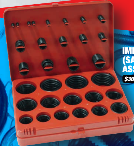
IMPERIAL (SAE) - O-RING ASSORTMENT $30.25 (K74146)