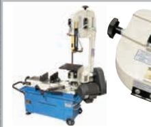
Vertical Cutting Table